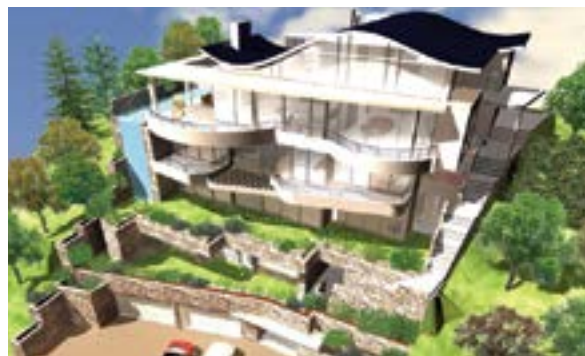
Barmaran Clifton Bugalow Football for Hope NECSA Visitor Centre House Muller