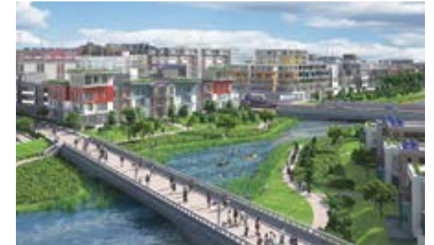
Milnerton Local Area Plan Milnerton Local Area Plan Wescap