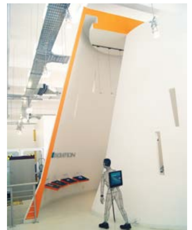
Malmesbury Community Health Centre Barmaran MyCiti Stadium Station MyCiti Airport Station NECSA Visitor Centre