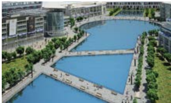
Mfuleni Urban Node Precinct N2 Gateway Wescap